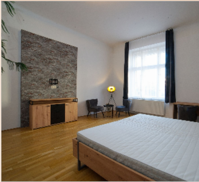
1094 Budapest, Márton utca